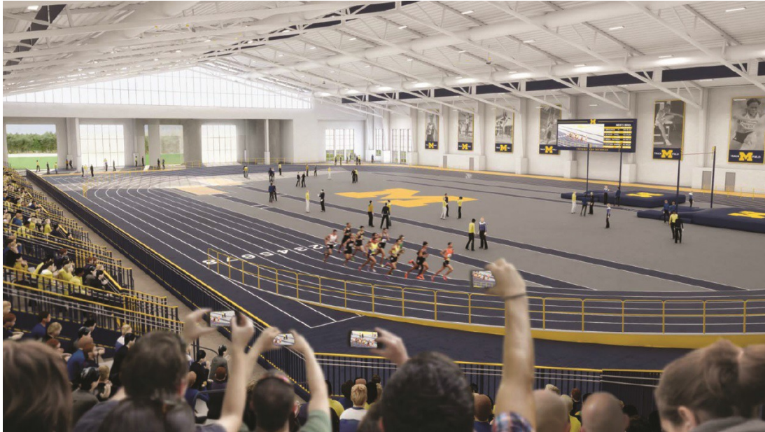
The same surface will be at our new facility, set to open December 2017

When the new building opens in December 2017, it will contain the same surface with a 2,000-seat capacity indoors, featuring 200-meter banked and 300-meter flat tracks. It will be the only facility in the United States with both tracks. Outdoors, the facility will have a 500-seat capacity set of bleachers conveniently placed in between the outdoor track surface and the throwing bays, adjacent to the indoor facility.